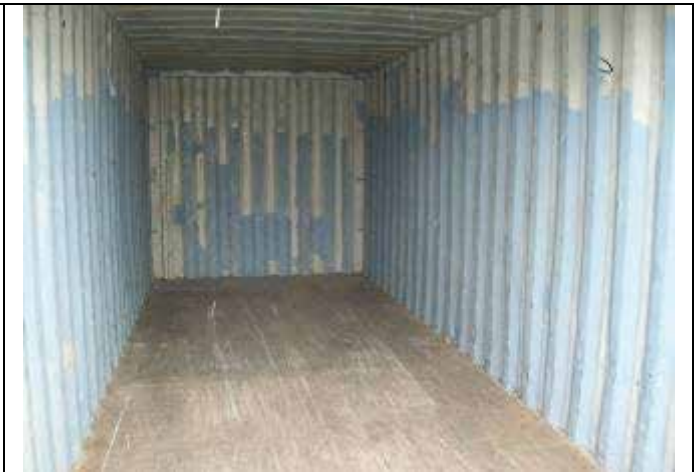
Container No. CRXU 106466-7