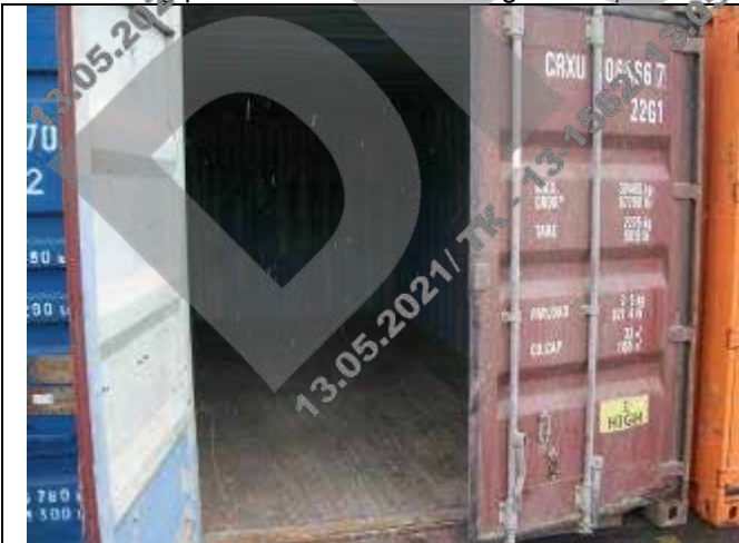
Container No. CRXU 106466-7

The following photos were taken during the inspection: