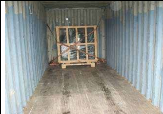
Cargo fixing in container