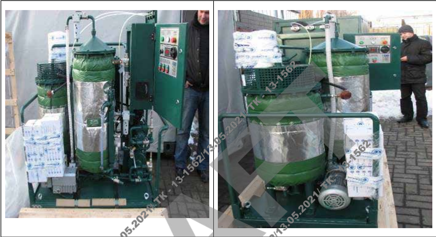
View of equipment