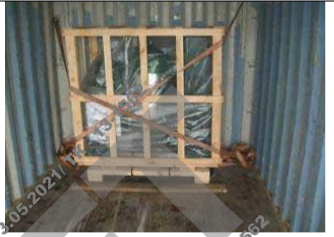
Cargo fixing in container