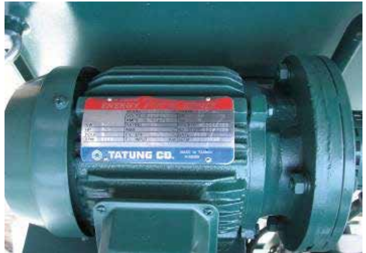
View of equipment