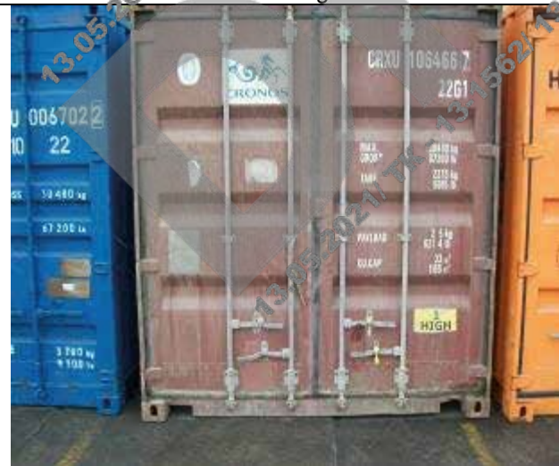
Sealed container with cargo