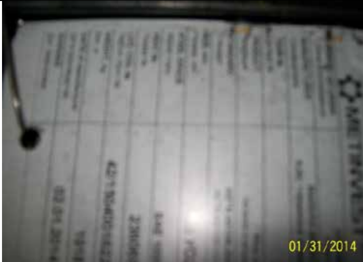
View of tags