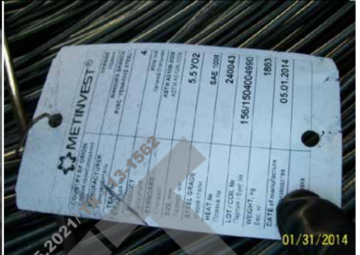
View of tags