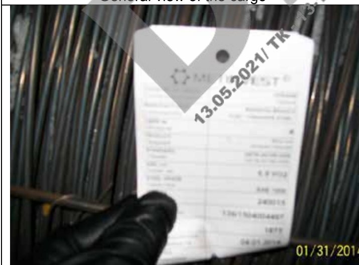
View of tags