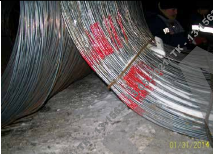
View of tags and marking