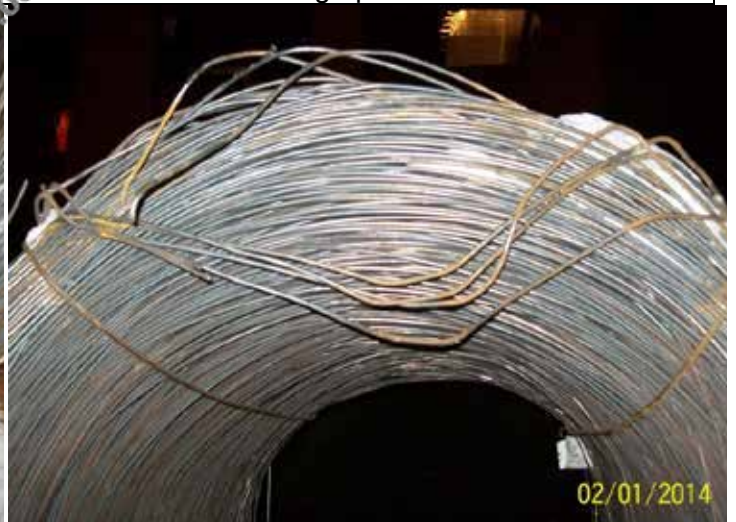
Damaged coils found