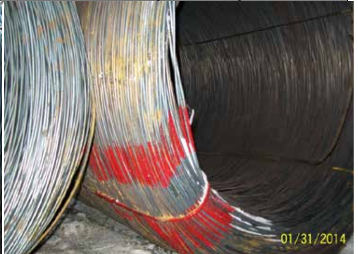
View of marking