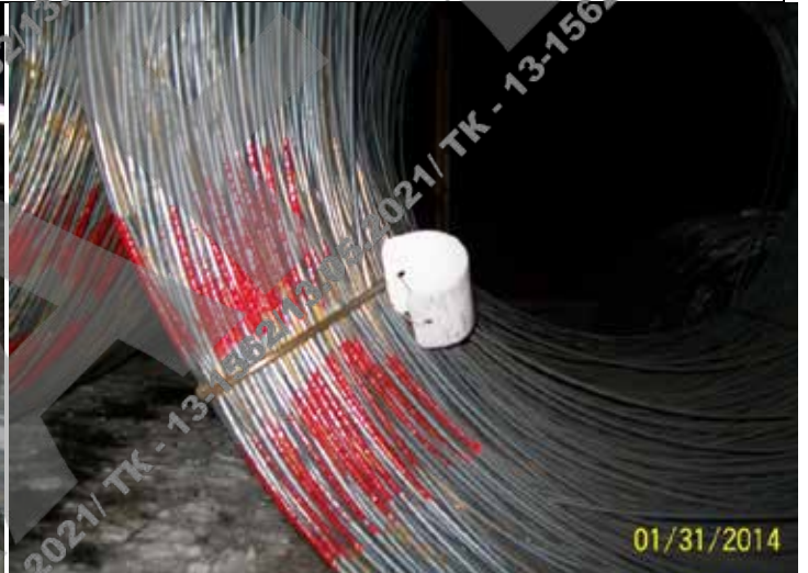
View of tags and marking