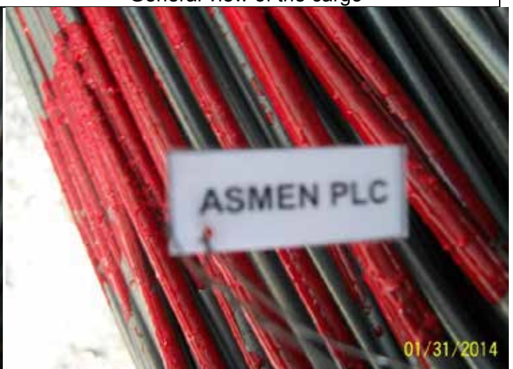
View of additional tags