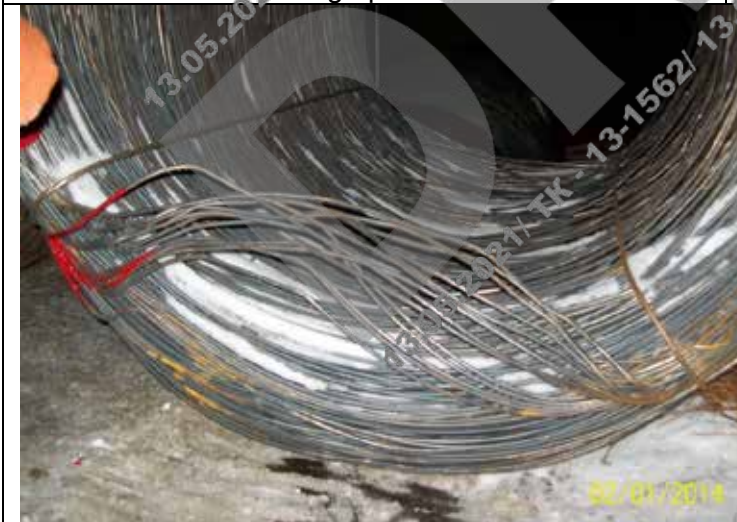
Damaged coils found