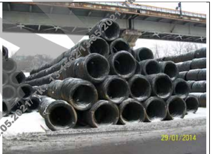
General view of the cargo