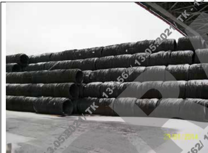
General view of the cargo